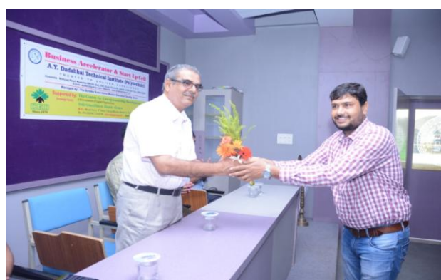
Floral Felicitation of Guests from CED