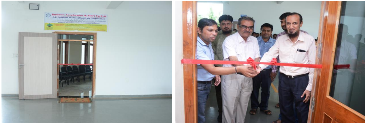
Inauguration of "Business Accelerator and Start-up Cell"

It's an honor for our institute today that we are starting " Business Accelerator and Start-up Cell " supported by The Centre for Entrepreneurship Development (A Govt. of Gujarat Organization) at the A.Y. Dadabhai Technical Institute, Kosamba.