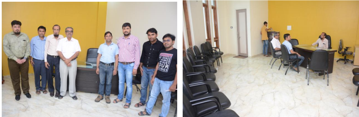
Inside view of the BASP Cell